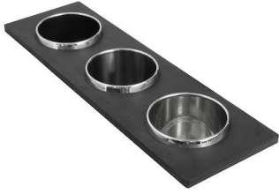
3 Bottles-holder set 8100 621